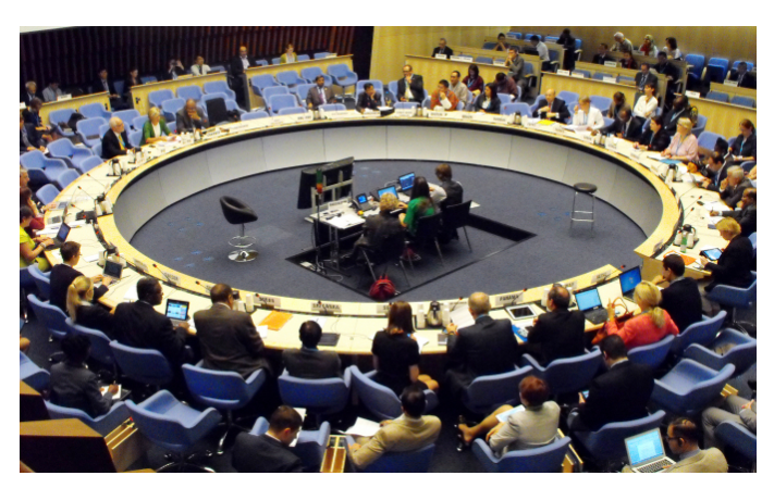
Delegates settle into the plenary to discuss the final summary and conclusions More information about the WHO Conference on Health and Climate:

www.who.int/globalchange/mediacentre/events/climate-health-conference/en/