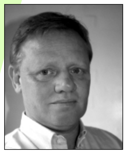
Dear friends and colleagues

In this article I will give some reflections on what has happened lately and give some indication on my perspectives on the near future.